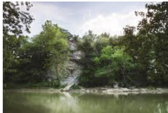
Hanging Rock Lagro, Indiana

These beautiful sights are just a few all along the Wabash River that are waiting for you to come explore!