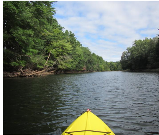
Along the Wabash River Huntington, Indiana